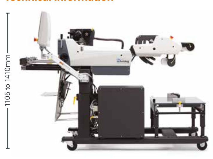
-1829mm Length x 889mm Width -